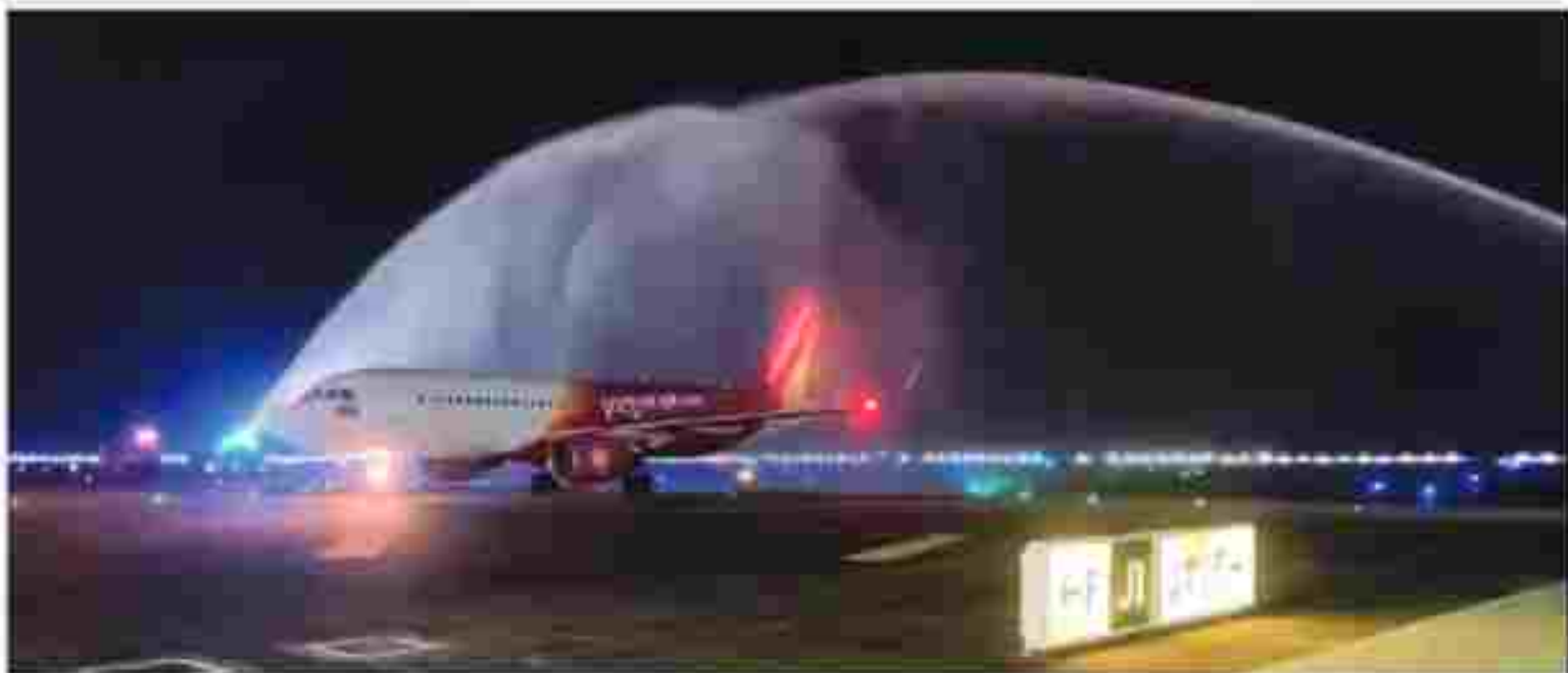
Swagatham to Kochi | CIAL ARSF welcomes Vietjet's first service from Ho Chi Minh city with a water salute.

This service marks a historic milestone for CIAL as it establishes the first direct air link between Kerala and Vietnam, creating a significant avenue for both business and leisure travel. Furthermore, this new addition complements CIAL's existing flight services to various Southeast Asian destinations, enhancing the airport's connectivity and reinforcing its status as a vital hub for international travel.