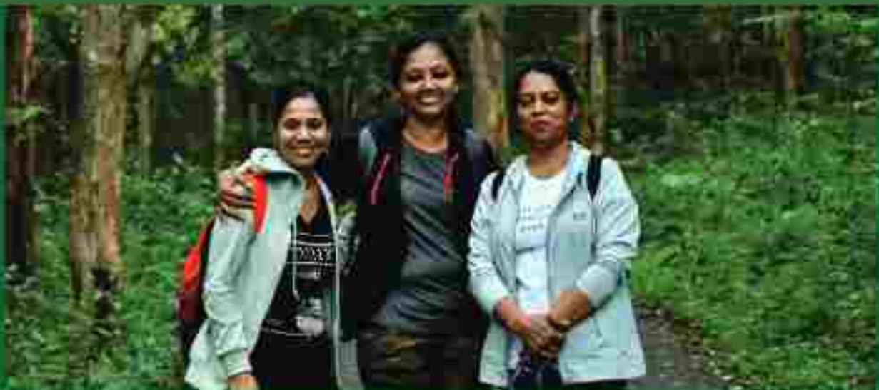
▲ Trekking to Peechi ▼